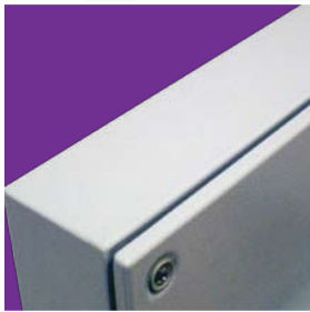
New design to enhance usefull depth