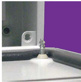
New quick locking-sytem with 1/4 turn fixing screws.