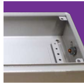
Earthing facilities & Support for Din-rails/M.P