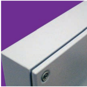
New design to enhance usefull depth