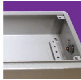
Earthing facilities & Support for Din-rails/M.P